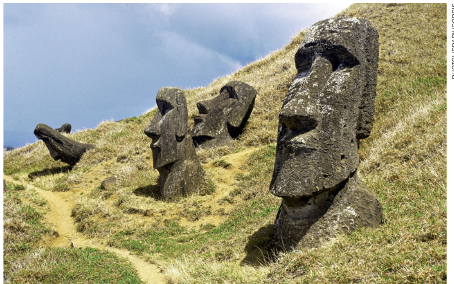
Debate surrounds the transportation of Easter Island's statues and the disappearance of its forests.

In The Statues That Walked , Hunt and Lipo argue for a late date of around 1200 AD for the